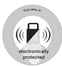
2928 EP Micro Tamper Tag