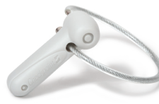
S-Tag & Lanyards