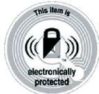
2933 EP Tamper Tag