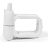
iS Shackle Tag

1.17" W x 1.42" D x 1.98" H (29.7mm x 36mm x 50.3mm)