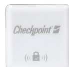
iS Fusion Tag

1.79" W x 1.79" H (45mm x 45mm) 0.16" Thick (4mm)