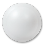
Gen 3 Hard Tag Series