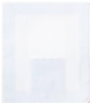
4210 Food Label (1.45" x 1.66")